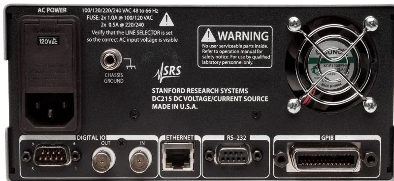
DC215 rear panel