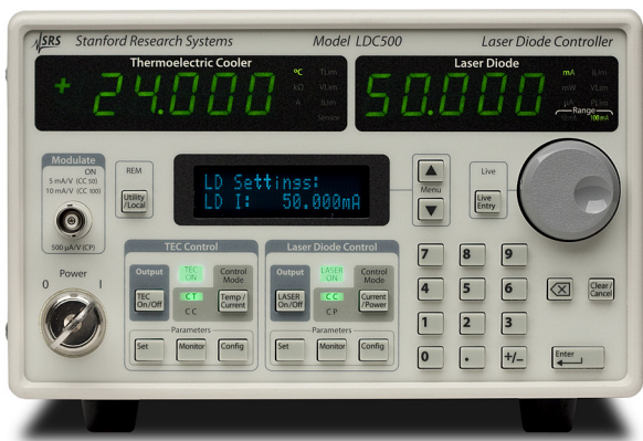
LDC500 front panel

The LDC500 series offers an auto-tuning feature which automatically optimizes the PID loop parameters of the controller. Of course, full manual control is provided too. Dynamic transfer between CT and CC modes for the TEC is also easy — just press the Temp/Current button.