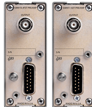
SIM910 & SIM911 rear panels