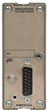
SIM928 rear panel