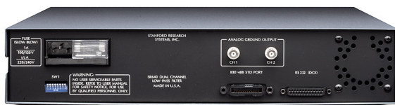
SR640 rear panel