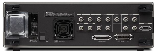
SR830 rear panel